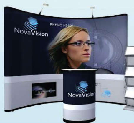
3 metre option